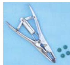
Elastic Band Applicator