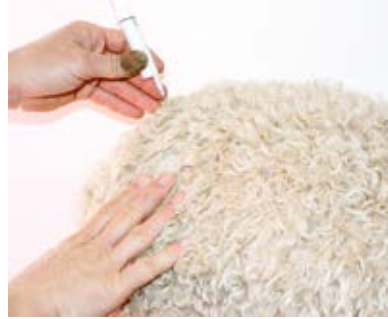
Intramuscular injection in the rump