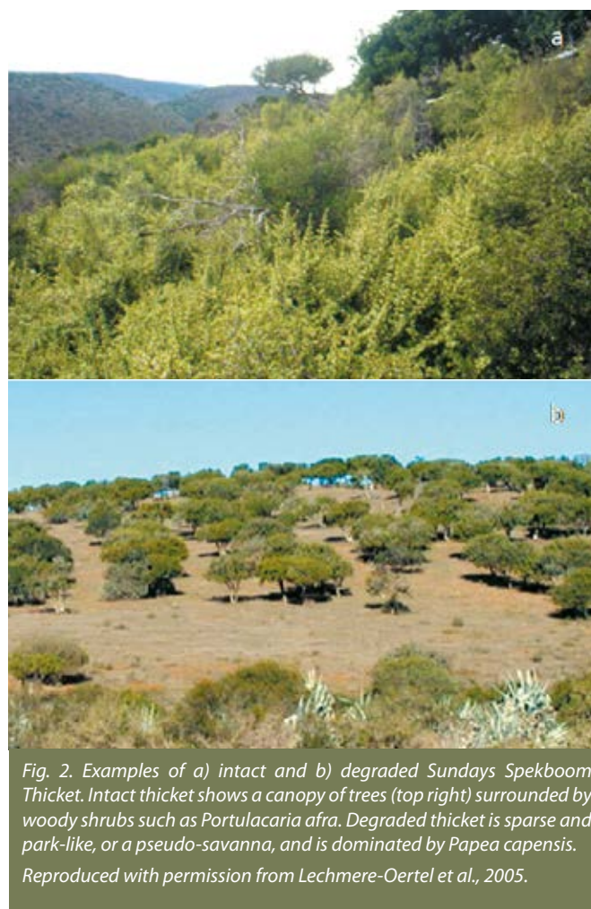
Fig. 2. Examples of a) intact and b) degraded Sundays Spekboom Thicket. Intact thicket shows a canopy of trees (top right) surrounded by woody shrubs such as Portulacaria afra . Degraded thicket is sparse and park-like, or a pseudo-savanna, and is dominated by Papea capensis . Reproduced with permission from Lechmere-Oertel et al., 2005.

It is, therefore, clear that the availability of tree and shrub veld should, to a large extent, determine the number of Angora goats on a farm. Over-grazing by Angora goats causes degeneration of bush and shrub veld, without necessarily harming the ground level vegetation to the same extent, and thereby creates a false impression of the veld condition. Degeneration of the bush and shrub veld will be detrimental to the mohair industry.