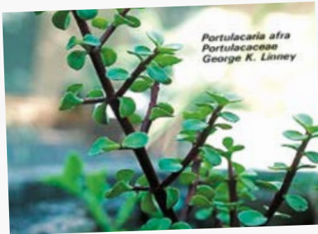
Portulacaria afra Portulacaceae George K. Linney

Tools to use water sustainably include indicating waterways and sources on the land use plan, removal of infestations of invasive alien plants, monitoring of groundwater levels, effective irrigation, dam construction, inter-basin transfers to bring water from areas of surplus to areas experiencing shortages as well as water trading and relocation of water use by compulsory licensing.