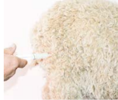
Intramuscular injection in the hind leg