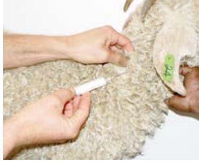
A subcutaneous injection in the neck region