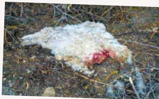
A young goat killed by a predator

To responsibly protect their goats from any form of threat and to care for their overall well being.