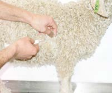
A subcutaneous injection behind the elbow